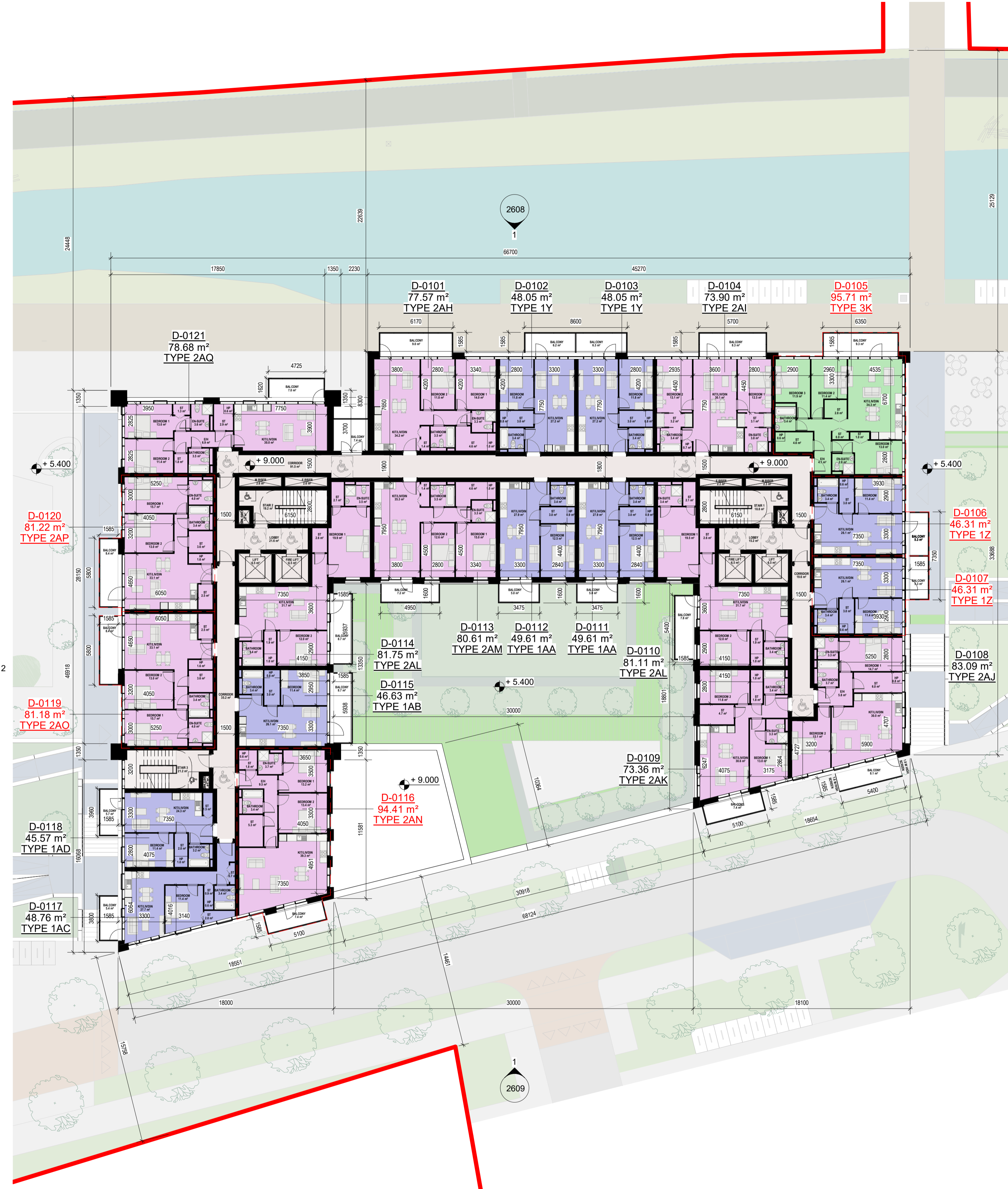
1 PLAN - BLOCK D - LEVEL 01 - PART V 1 : 200

Please consider the environment before printing this sheet